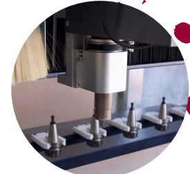
Optional Tangential Knife