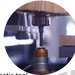
Automatic tool height sensing

Most soft materials less than 1300x2500mm can be cut in the T240. While primarily designed for timber and plastics, other materials such as aluminium and similar, Bakelite & HPL, foams, composite alloy plastic sign panel, carbon, Corian and other man-made solid surfaces etc. Steel, Stainless and other ferrous metals generally cannot be cut in a CNC router.