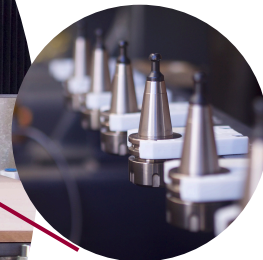
8-12 Loaded Tool Positions