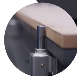
6 x Auto sheet positioning pins